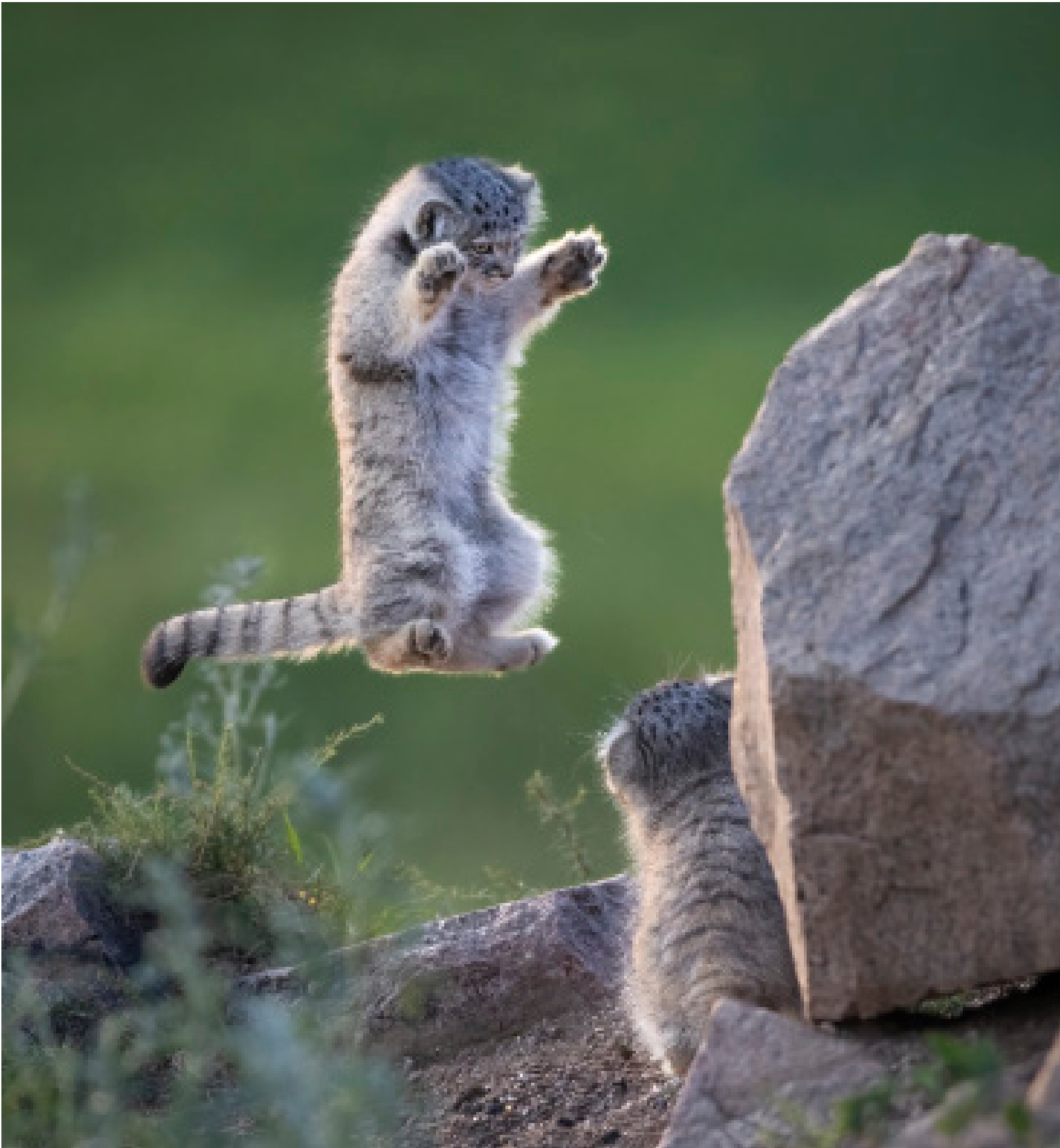
FIRST PLACE - MAMMALS | Zita Quentin, "Ninja Kitten"