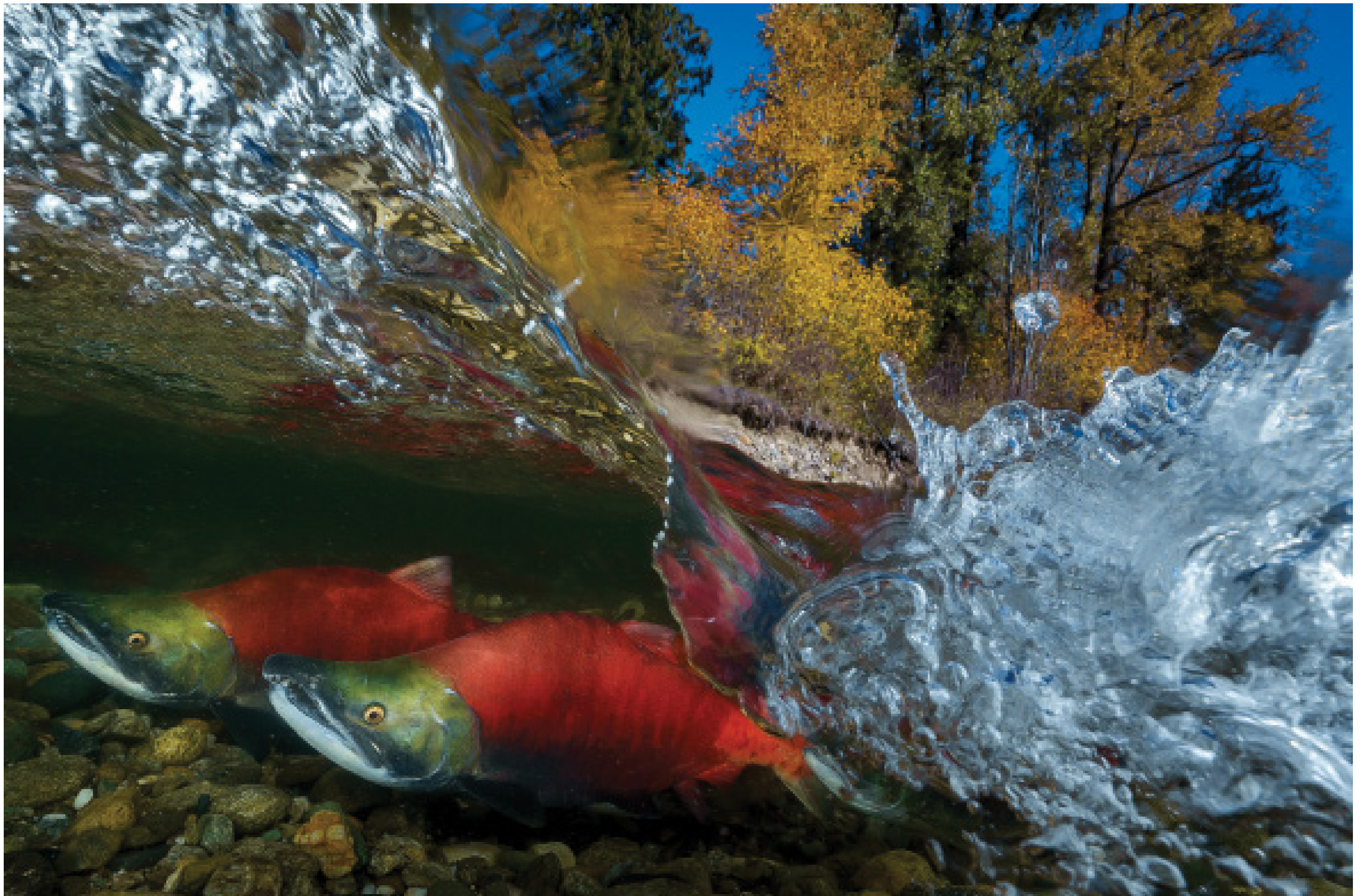
FIRST PLACE - UNDERWATER | Yung Sen Wu, "Salmon Run"