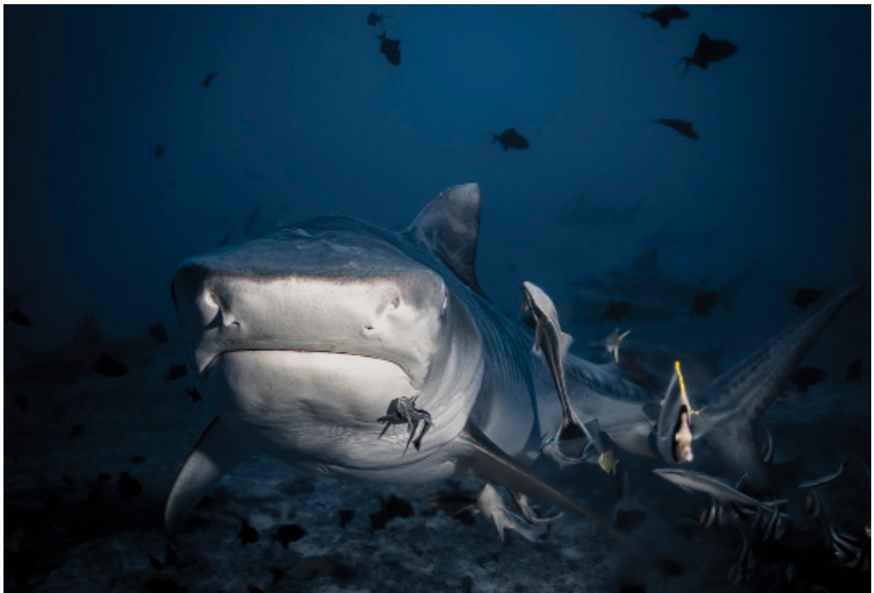
THIRD PLACE - UNDERWATER | Gilles Auroux, "Eye of the Tiger"