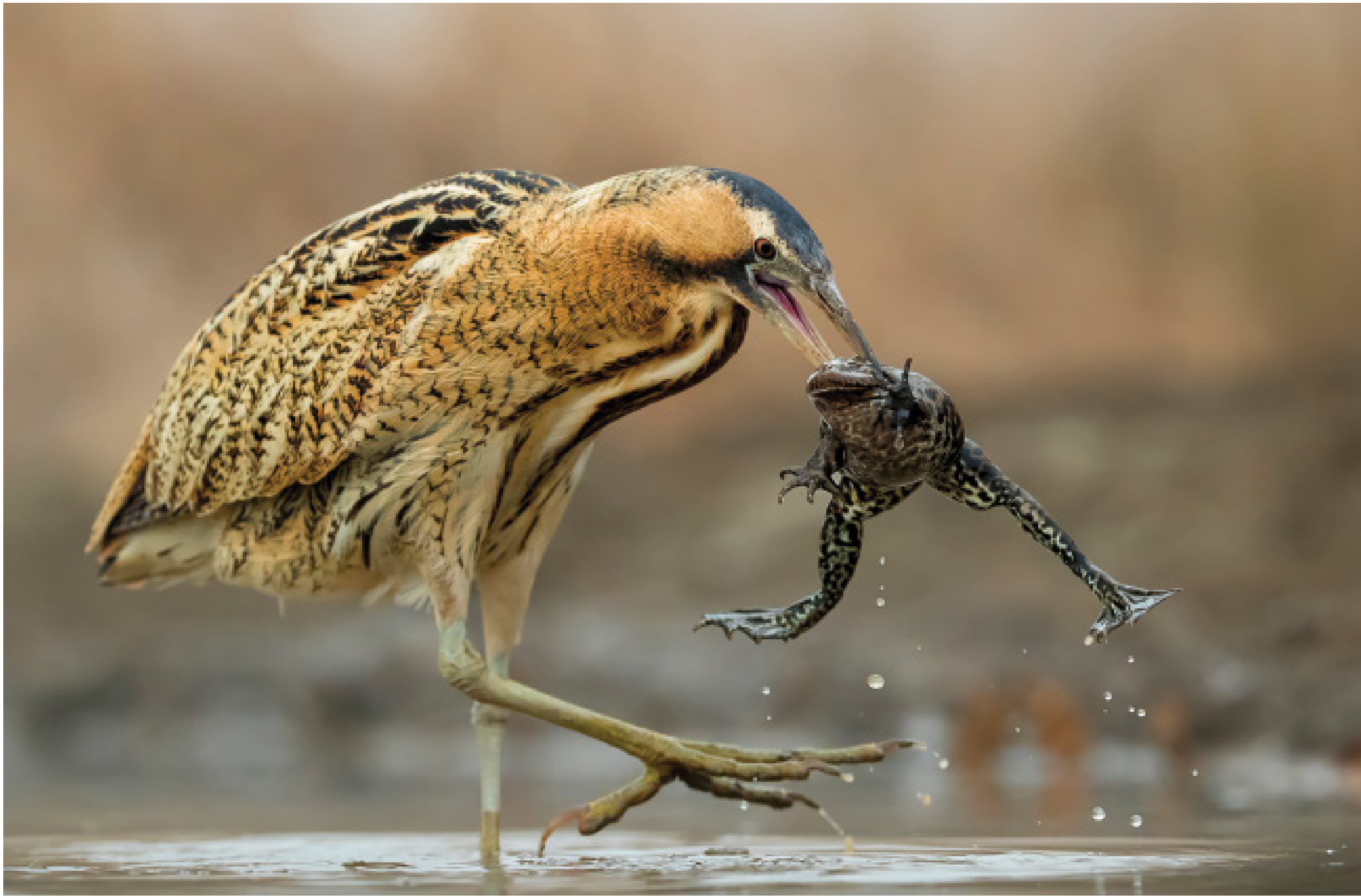
FIRST PLACE - BIRDS | Bence Mate, "Never Saw It Coming"