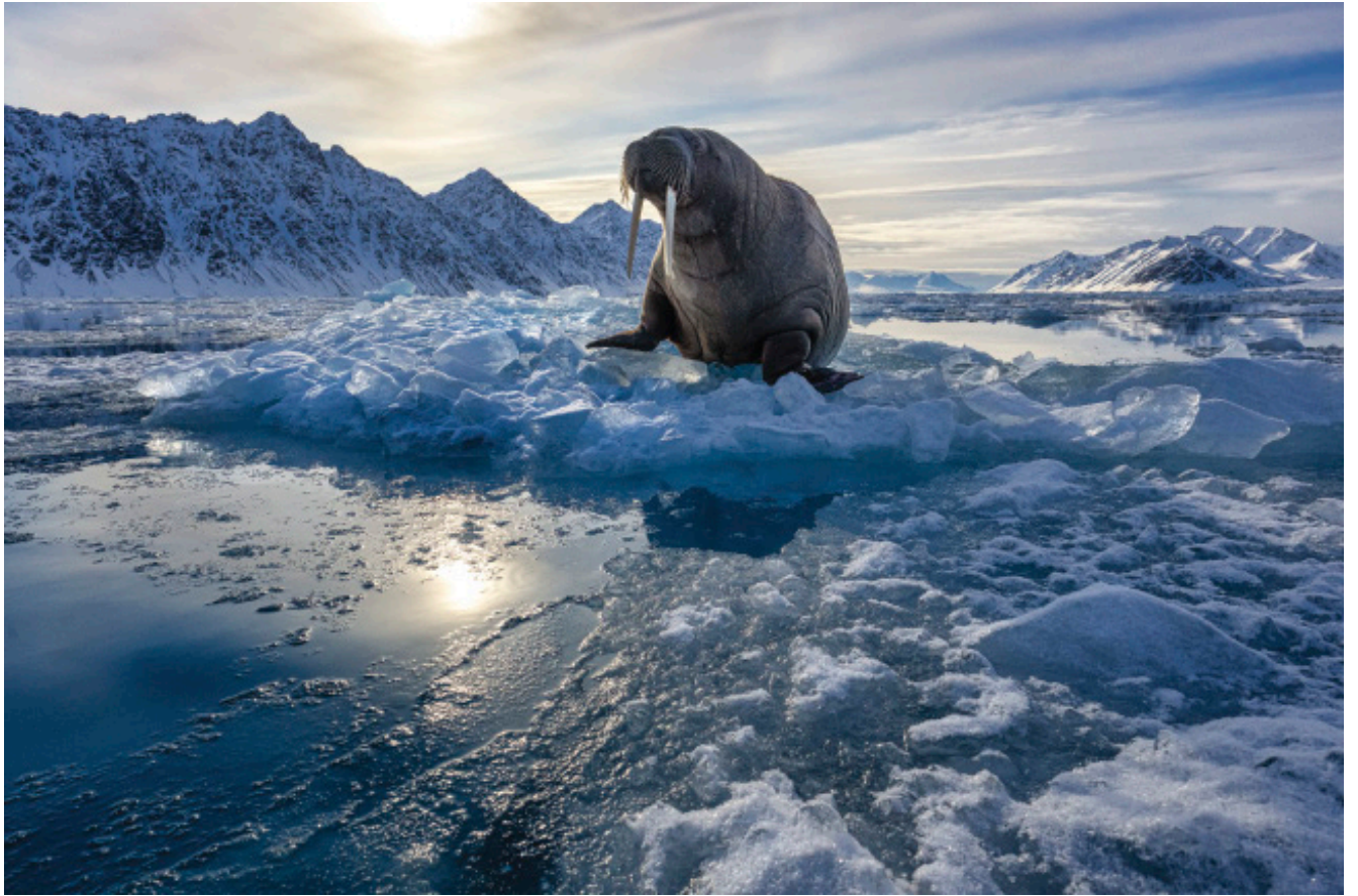
SECOND PLACE - MAMMALS | Thomas Happe, "Good Morning"