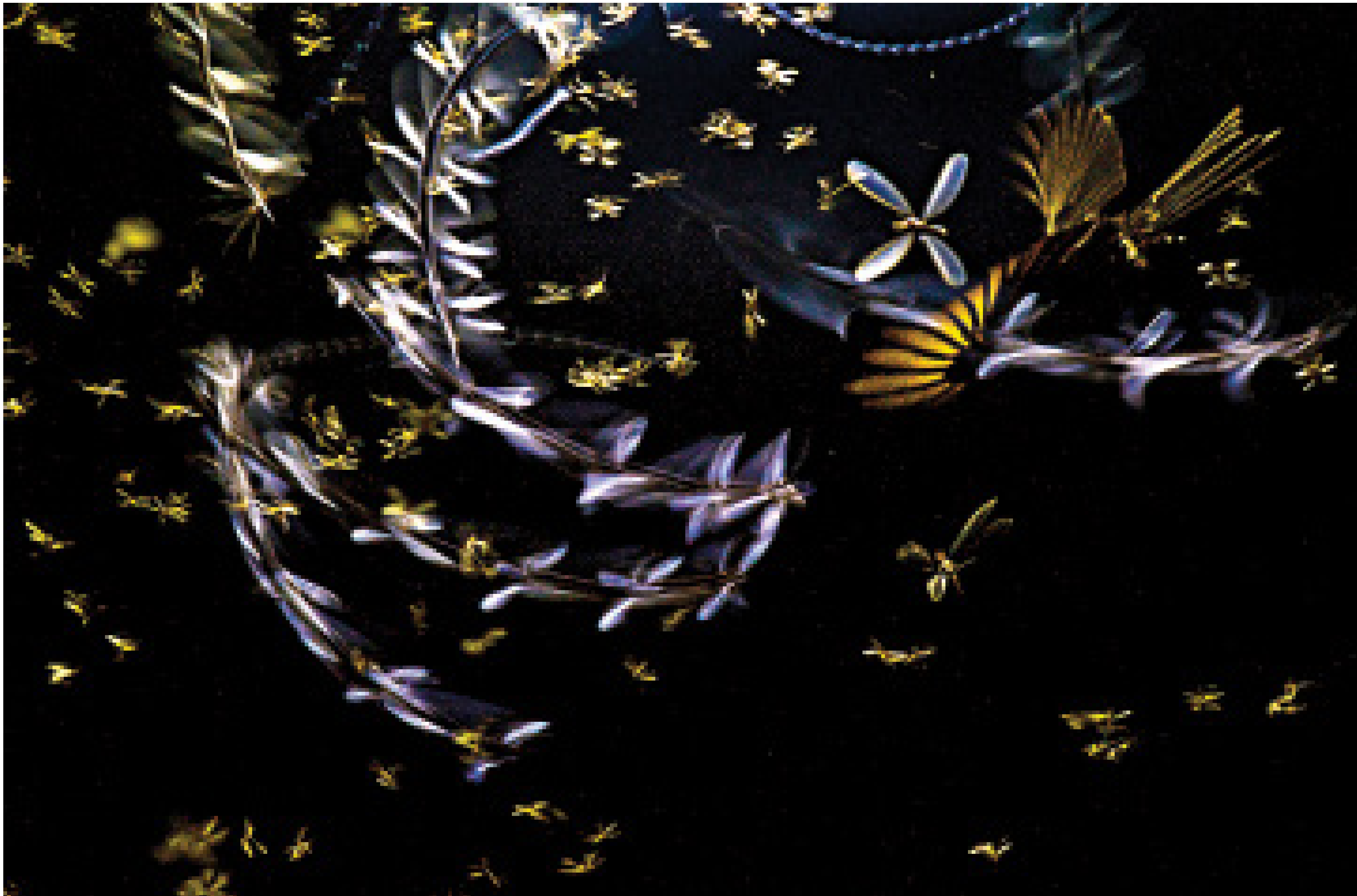
FIRST PLACE - MACRO | Anirban Dutta, "Intruder"