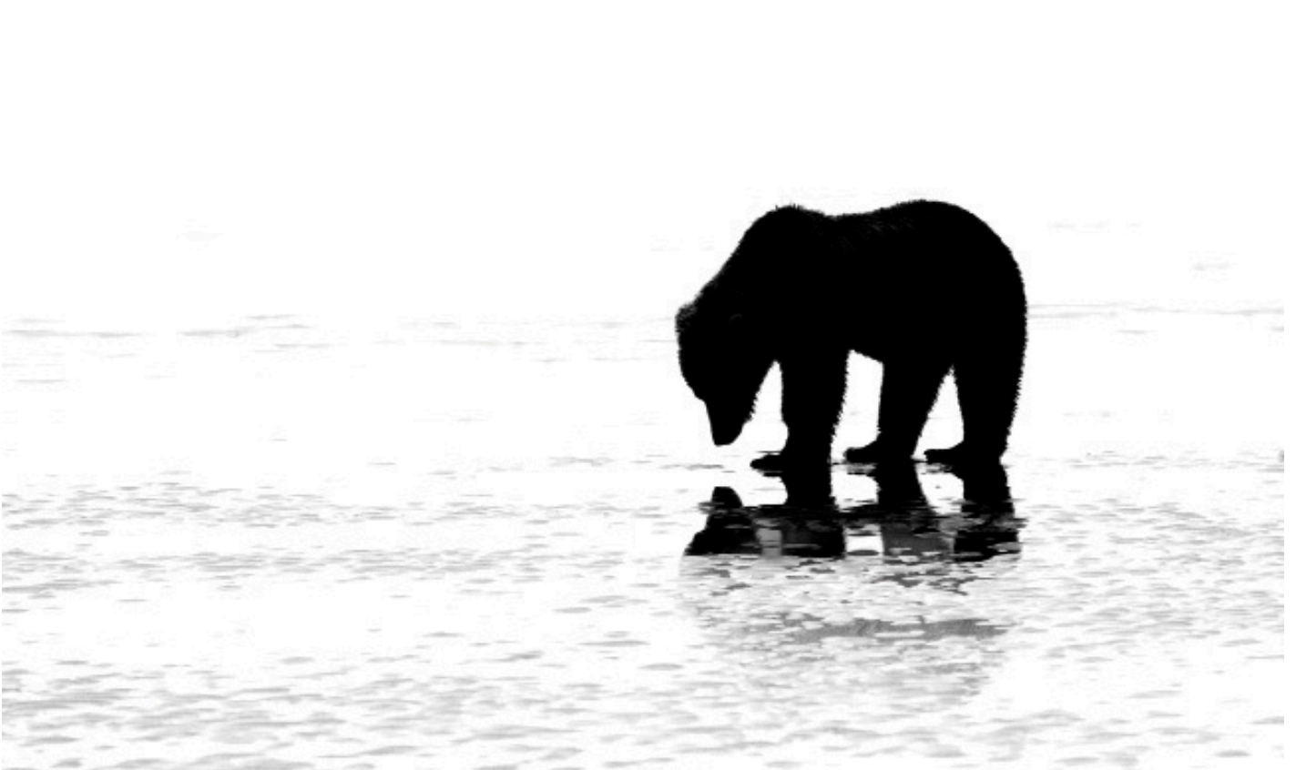
THIRD PLACE - BLACK AND WHITE | Patrick Nowotny, "Digging For Breakfast"