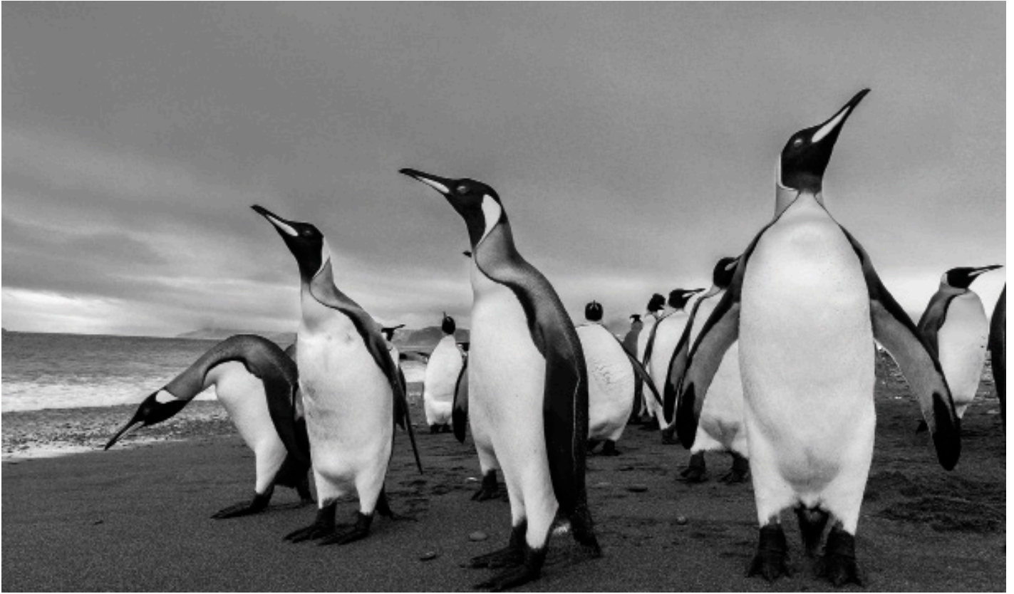
SECOND PLACE - BLACK AND WHITE | Bill Klipp, "The Gentle Beauty of King Penguins"