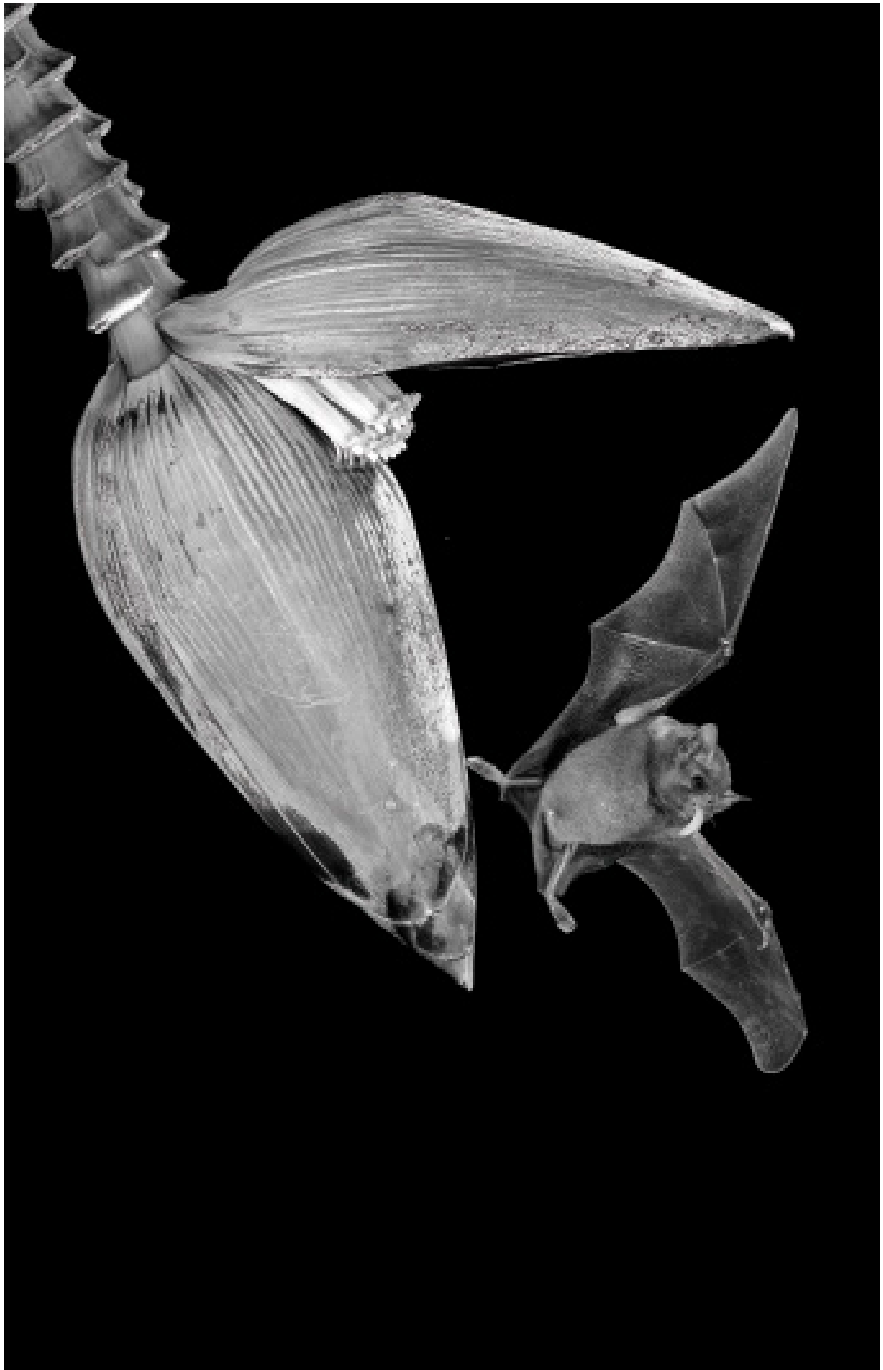
FIRST PLACE - BLACK AND WHITE | Anna Glenn, "Balancing Act"