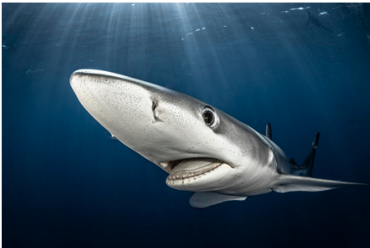
THIRD PLACE-UNDERWATER | Gillies Auroux, France, " Blue Shark ", Pico Island, Azores