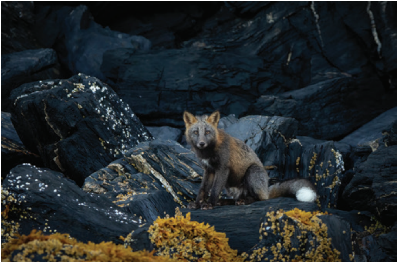
THIRD PLACE-MAMMALS | Zita Quentin, Hungary, "Cross Fox on Rocks", Alaska, USA