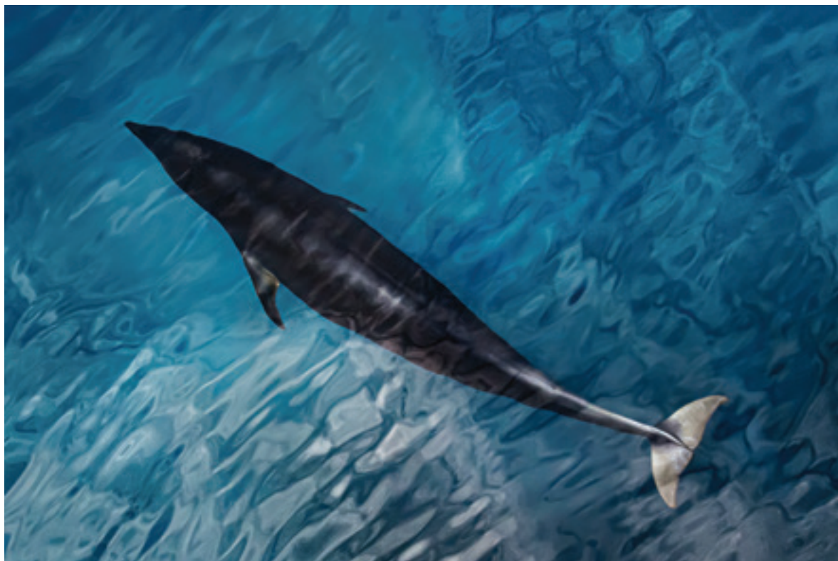
SECOND PLACE-UNDERWATER | Jodi Frediani, USA, " Northern Right Whale Dolphin ", California, USA