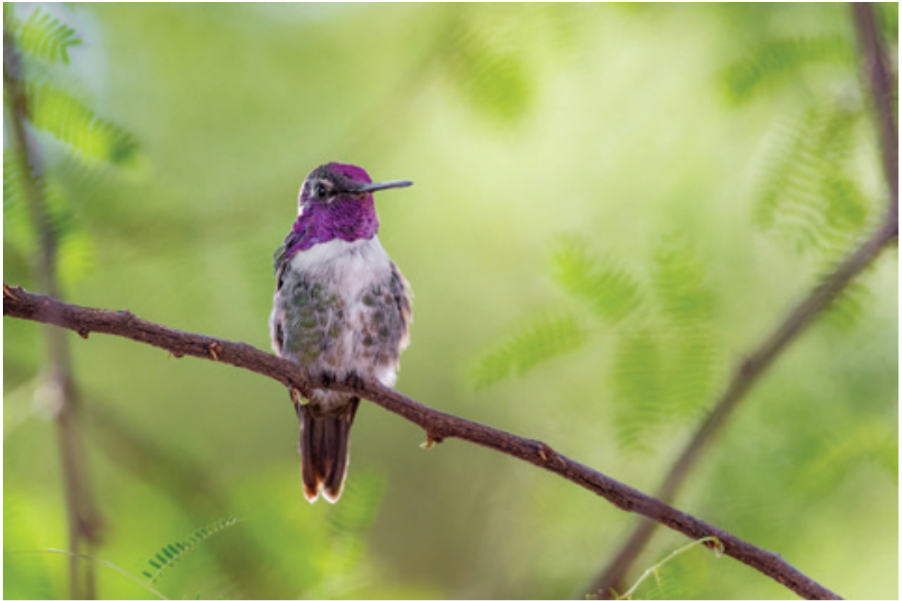
SECOND PLACE-YOUTH | Ilai Porat, Israel, "Costa's Hummingbird", Nevada, USA