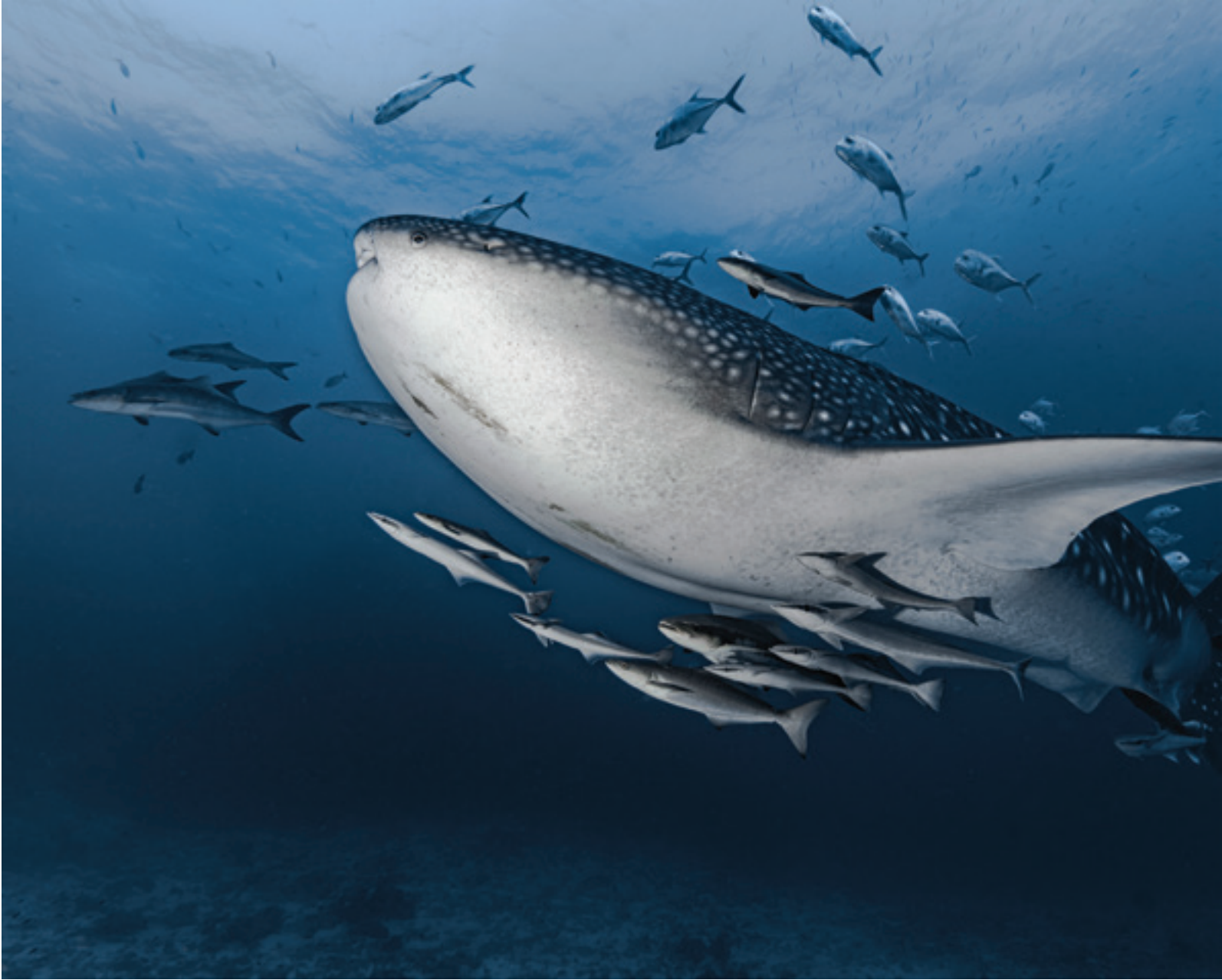
FIRST PLACE-UNDERWATER | Gillies Auroux, France, "Whale Shark", Thailand